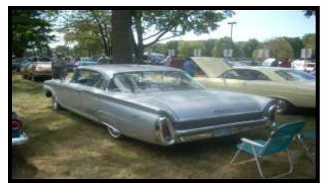
Ford Show Telegraph

was available with the curious weight saving unibody design, so the Parklane with a full frame may have offered the smoothest ride available that year. This car was built in September of 1959 which made it one of the first of the big Mercs off the line at the Wayne, Michigan assembly line. This design came in at an amazing 81.5 width measurement. Some state regulators threatened that the Mercury was over their 80 inch width regulation, but Ford promised to never break this informal law again, and they never have.