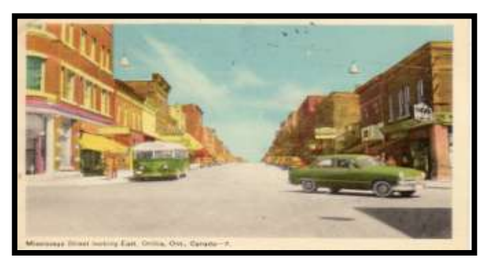
Mississaga Stree, Orillia, Ontario

I his month we have a postcard from a foreign country...OK, it is only Canada, but it is a foreign country; and what we see in the card is unusual. The