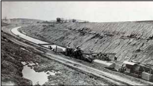
Construction of the High Speed Track.

The construction company set up shop in the dairy barn (across from the present salt bath). In future months this would become a popular spot for Ford employees during coffee breaks because the construction company arranged for a catering truck to come in and feed their workers during their breaks.