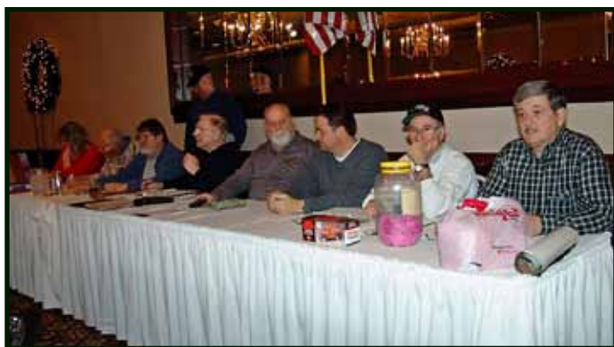
The 2011 Board at its first membership meeting.