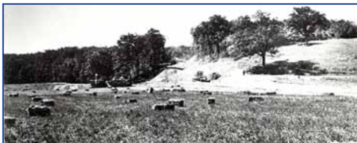
The transition from farmland to proving grounds begins.

"Early in 1954 the Roy Annett Realty Company, out of Pontiac, started calling on residents of the Romeo area asking a strange question "Would you be interested in selling us an option to purchase your property?" It didn't take long for the area citizens to discover that something big was in the works. Among some of the more interesting rumored uses for the land were: a U.S. jet manufacturing and launching site, a ranch for a famous TV star, a worlds fair grounds, a U.S. Air Force Academy, and a subdivision for professionals.