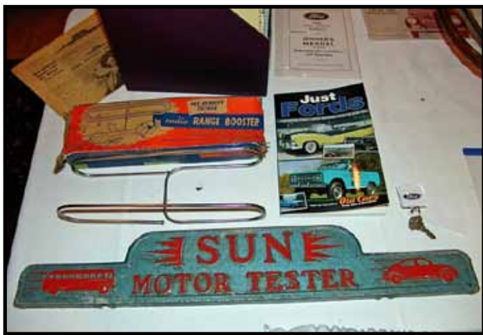
Some of the items that were brought in by members.