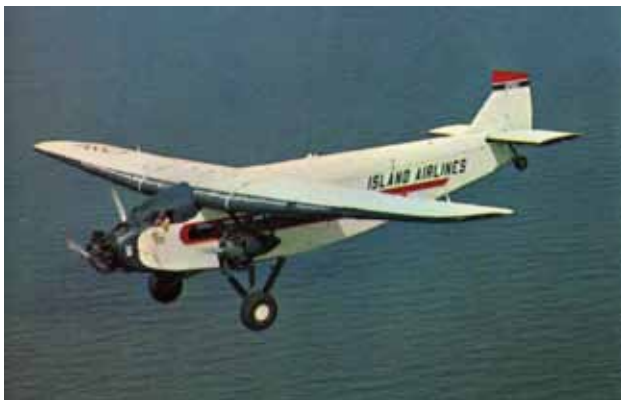
Ford Tri-Motor Postcard.

Henry Ford was at one time or another involved in virtually every form of transportation. He built cars, owned a railroad, owned ships, built busses, and in the late 1920's even built airplanes. This month's postcard is of one of those: the famed Ford Tri-Motor. This postcard is from Island Airlines which billed itself as the Shortest Airline in the World.